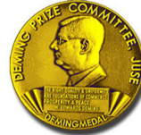
Deming Prize, Japan, founded 1951